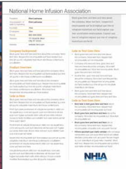
2 page listing - company overview