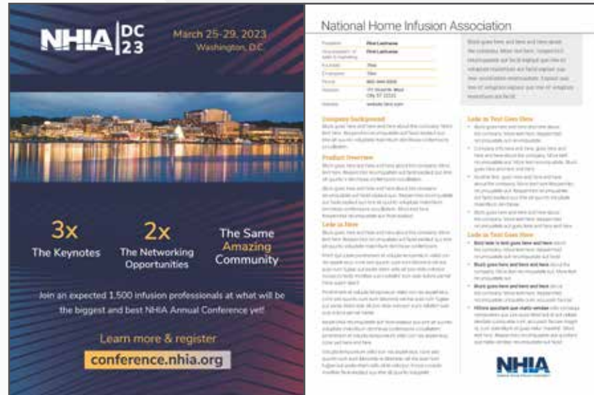
2 page listing - ad

If your company is interested in an enhanced listing for the 2026-2027 Products & Services Guide, contact advertising@NHIA.org .