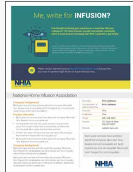
1 page ad/company overview